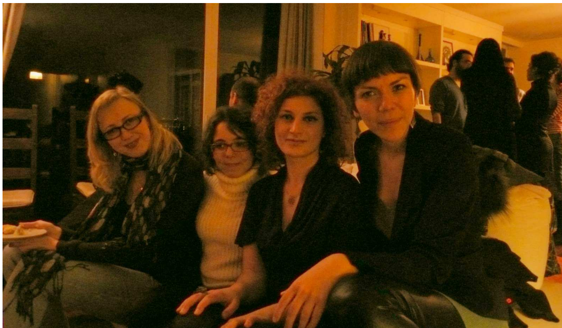
The four Elenas of the class (Russia, Greece and Bosnia and Herzegovina)